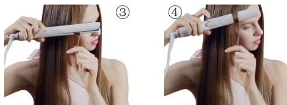
Twist the iron all the way up