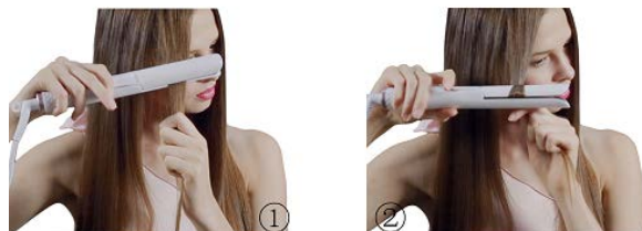
Take a small section of hair & Wrap the hair to the back